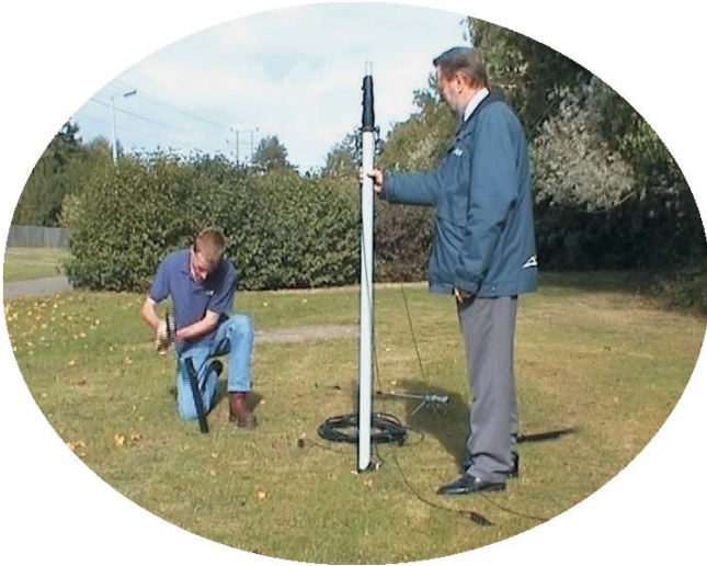
(Install guying kit)